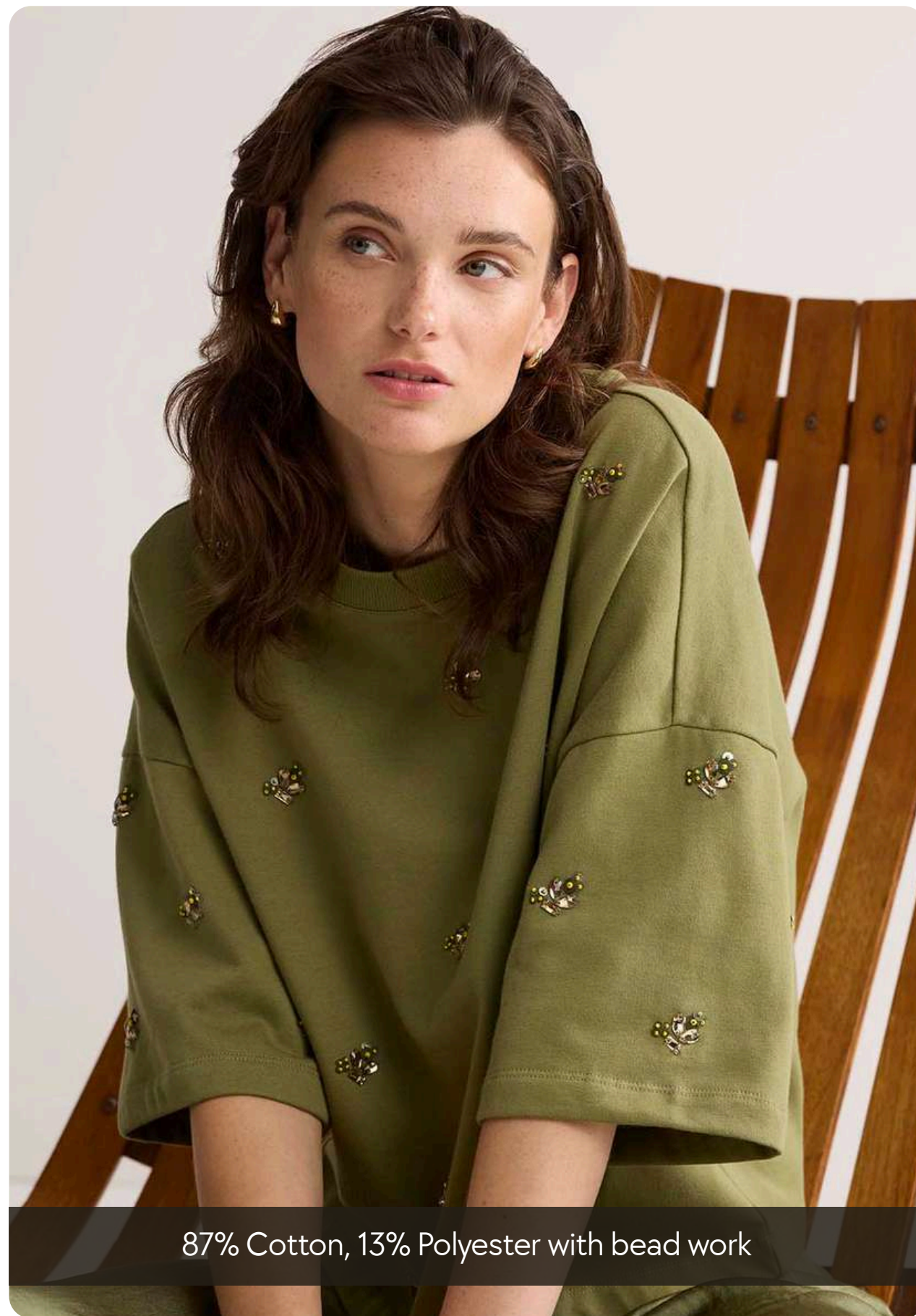
87% Cotton, 13% Polyester with bead work