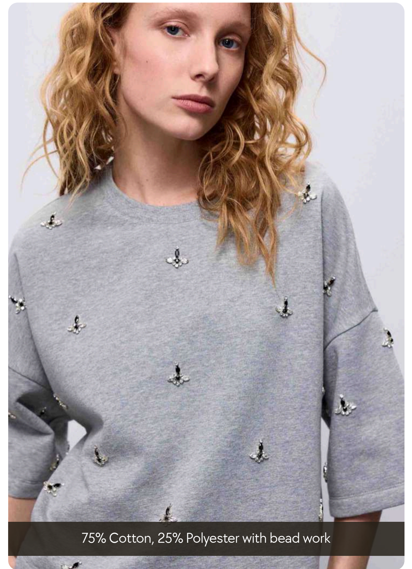
75% Cotton, 25% Polyester with bead work